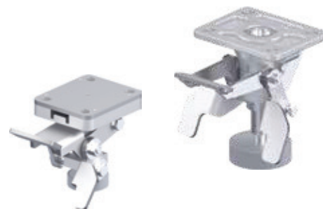
FF 125 - FF 200