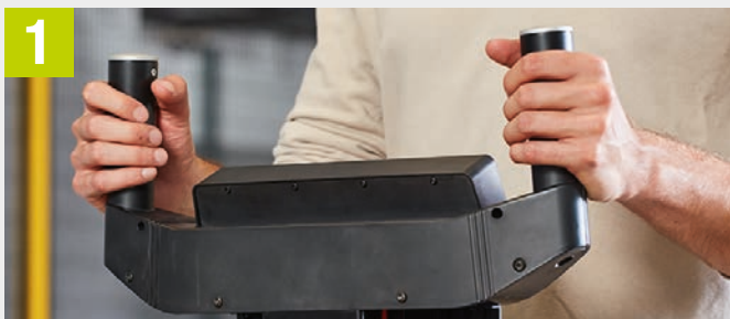
1 Intuitive operating handle with power sensor

It also has all the relevant safety features. Existing and newly designed equipment, workshop trolleys and other electrified means of transport can be quickly and easily retrofitted thanks to pre-assembled components via plug & play.