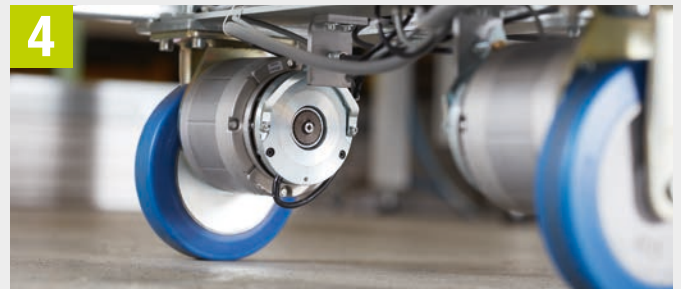
4 Drive, steering and braking assistance