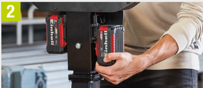
2 Always ready for use due to the use of exchangeable batteries